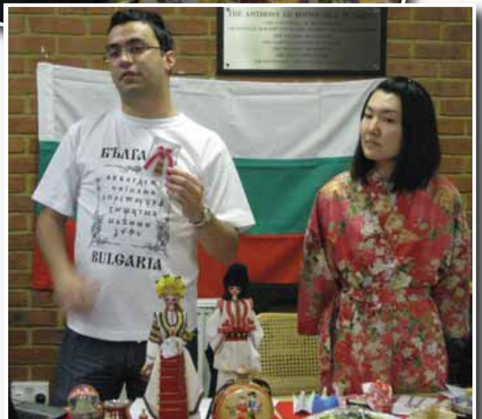
MSc Service Management students present their countries